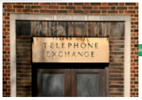
Local telephone exchange

Fibre cables All types of fibre cables both internal and external, OM1, OM2, OM3 and OS1. Cables can be supplied in full drums or cut to length, delivered to your stores or direct to site.